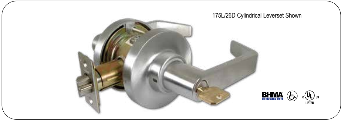
175L/26D Cylindrical Lever Set Shown

Marks USA New 175 Grade 2 Economy Series gives you the performance and quality of a Grade 1 lockset at a Grade 2 price. Perfect for commercial applications in Office Buildings, Schools, Universities, Hospitals and much more. This series is offered in conventional cylinder, IC core for "Best" size cores, Medeco®, Corbin and Schlage® as well as others. All functions are available in two standard finishes, are UL Listed for 3-hour fire rating, satisfy ADA requirements and are backed by Marks lifetime mechanical warranty.